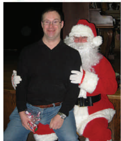
Christmas Party, December 2011

Great food. Fun carol singing. And a visit from Santa. What a terrific party!