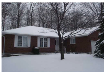
Monarch Place, Waterloo

tings within the community. One individual resides in an existing apartment at one of our homes and another young man has moved, with great excitement, into an apartment of his own. (See "Living the Dream" below). This frees up